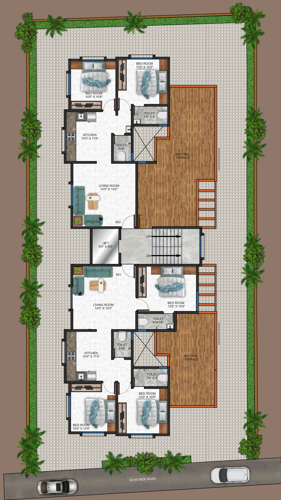
SIXTH FLOOR PLAN