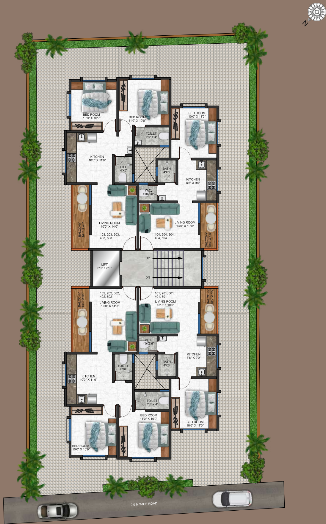
FIRST TO FIFTH TYPICAL FLOOR PLAN